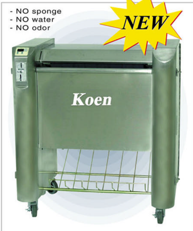
Air blower type MODEL: KM 300A