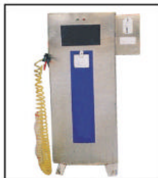
liquid supplier for wipers

Model: KV 32 Material : All Stainless steel frame Out put : 2400 (W) / 3.2 HP Motor : Dry and wet Power supply : 220V/1ph/2.5 KW Dimensions : 600(W) X 630(L) X 1,080(H) mm Weight : 26 kg