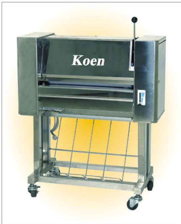
Sponge roller type